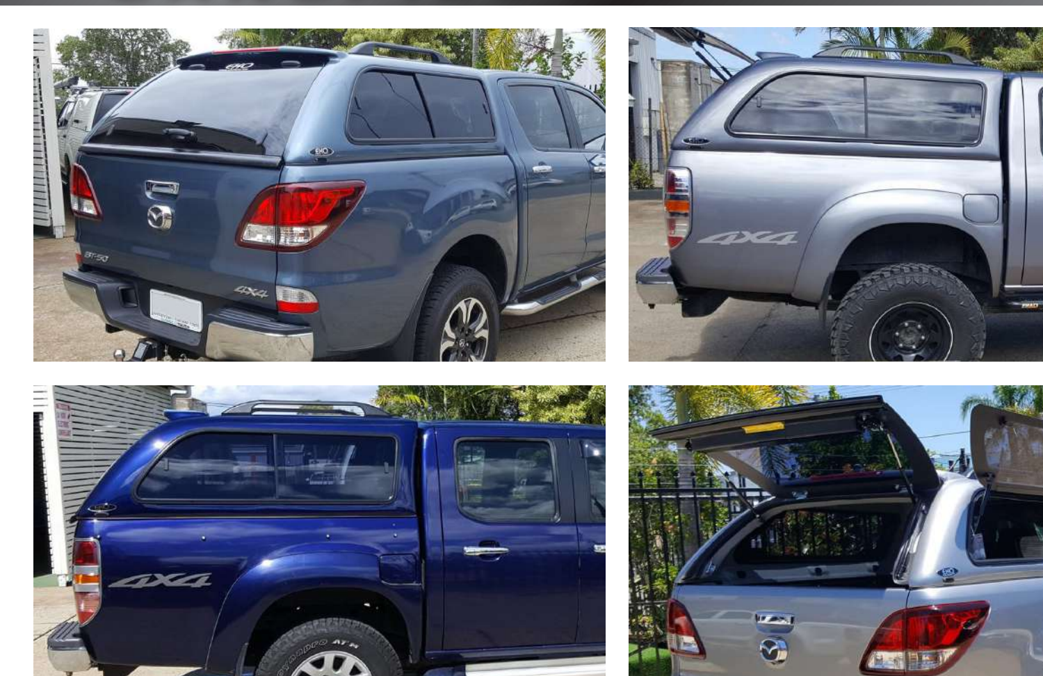
Our canopies are sleek and stylish manufactured to the highest standard and colour coded to match OEM colours